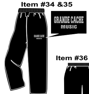
Item #36 & 37